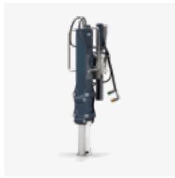
Swivel system with 500 mm telescope