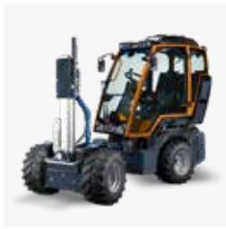
Implement mast with hydraulic block unit & additional hydraulic functions