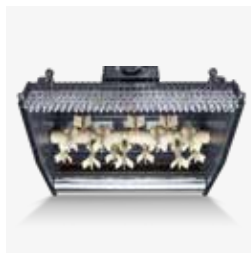
Mower model SM90 with a working width of 90 cm