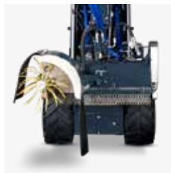
Hydraulic shoot remover (on request: individually controllable brush)