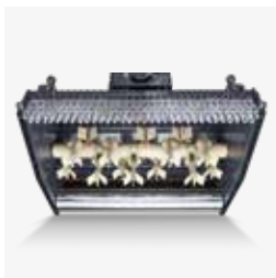
Mower model SM80 with a working width of 80 cm