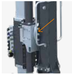
Quick rotation system (180°)